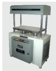
Twin Book Press