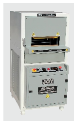
Joint Forming Press