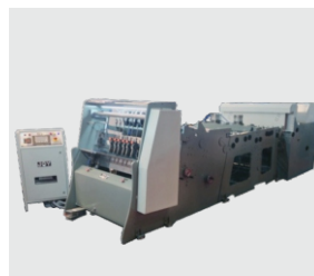
Exercise Notebook Line