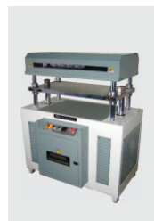
Dual Book Press