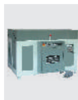
Major Edge Squaring