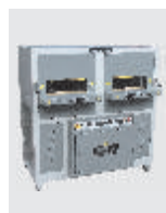
Twin Joint Forming Press