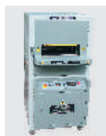
Joint Forming Press