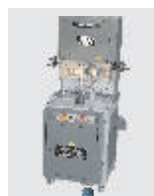
Twin Corner Cutting