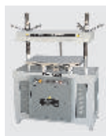
Twin Book Press