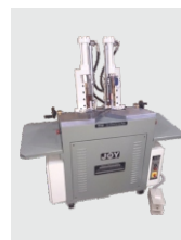
Twin Corner Cutting-II