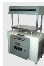
Twin Book Press