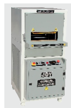
Joint Forming Press