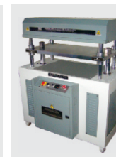
Dual Book Press