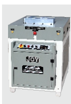
Smashing & Nipping Press