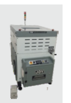
BB Rounding & Backing

JOY'S experience and knowledge of book-binding acquired in the past two decades is reflected in the competence, quality standards, using indigenous inputs and dedication in search of new solutions for producing excellent finished books, magazines and stationery items through the most economical means.