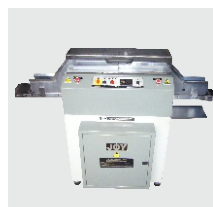
Nipping & Smashing OL