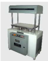
Twin Book Press