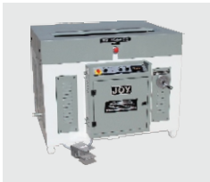
Edge Squaring Press