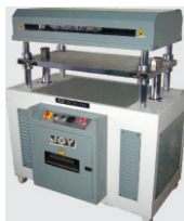
Dual Book Press