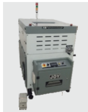
B B Rounding & Backing