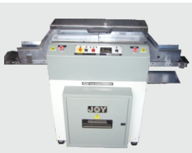
Nipping & Smashing OL