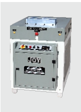
Smashing & Nipping Press