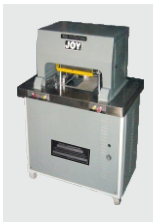
B.Three Side Trimmer