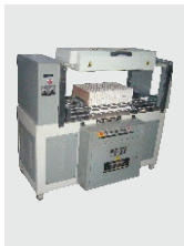
Book Spine Pre-Gluer

JOY'S experience and knowledge of book-binding acquired in the past two decades is reflected in the competence, quality standards, using indigenous inputs and dedication in search of new solutions for producing excellent finished books, magazines and stationery items through the most economical means.